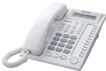
■ KX-T7730 LCD, Speakerphone Unit

* An optional card is required. Please contact your dealer or phone company to confirm if the Caller ID service is available in your area.