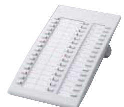
■ KX-T7740 DSS Console