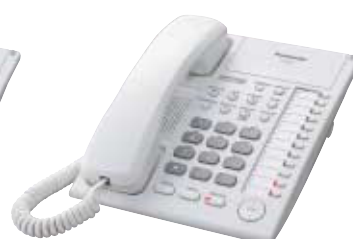
■ KX-T7750 Monitor Unit