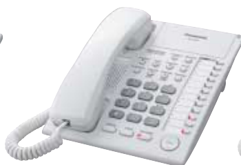
■ KX-T7720 Speakerphone Unit